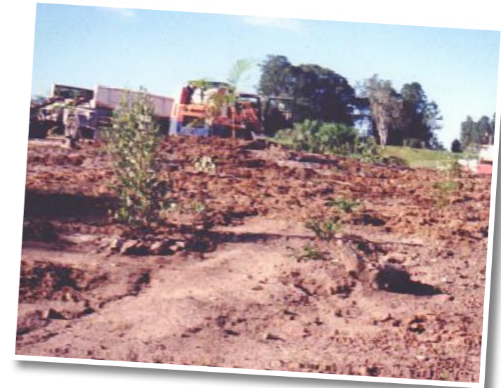
Close up view of making the roundabout, many of the same plants are still there.

For this we all headed up to Anne and Rod Burrell's house, near the Sanctuary, for a beautiful spread of homemade goodies and a welcome mug of something hot.