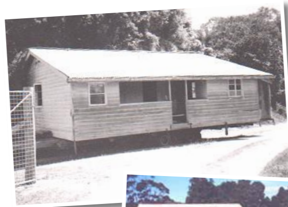
Cane cutters building on site.

All was proceeding as per plans and the next move was to bring the cane barracks up to the proposed area allotted to it. Relocation of the building using local builders came to $15,000.