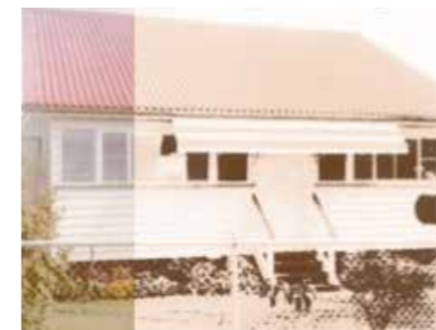
The School Residence was built in 1920 and is the oldest public building in Bli Bli.