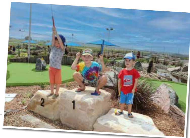
Maroochy River Golf Club - Lots of family fun at Maroochy River Mini Golf... Let's play!