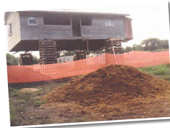
The barracks awaiting a new roof and bricking in underneath in May 1990

Thus 30 or so bedraggled, muddy bodies emerged from the bush to be told "OK, grab a shovel and plant a tree!" Great – more mud! Still, wasn't this why we were all there? To give of our time and energies? So, after beautifying the round-a-bout area of the car park, we were ready for a cuppa and a chat.