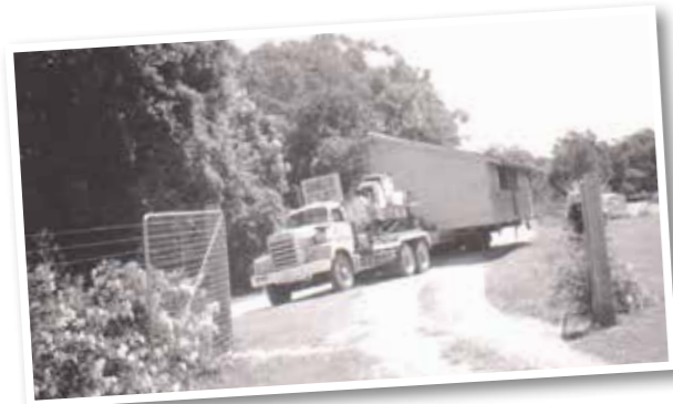
Truck slowly moving up Sports Road on it's way to its destination.